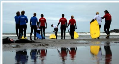
CAMHS (Children and Adolescent Mental Health Service) Surf Tonic Project