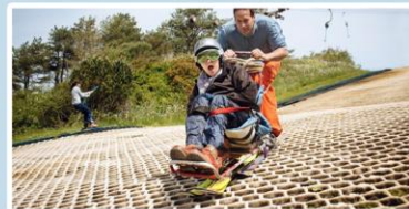
Ski 4 All Wales