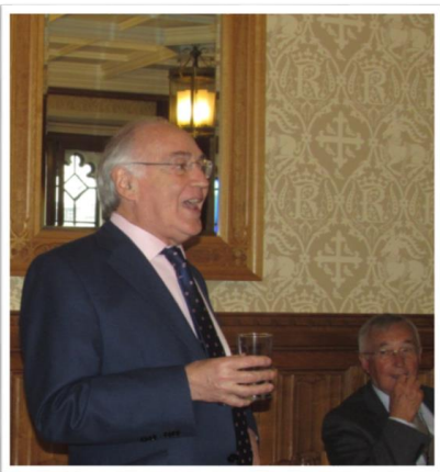
Former pupil and Honorary Patron of the Association Michael Howard, the Lord Howard of Lympne hosted a reception for members at the House of Lords

Development of the Association Webpage included the facility for online membership and as a result we now have 132 former pupils paying at least the suggested minimum membership fee of £5 per annum. In reply to demand we have also included a 10 year membership for £50 and a life-time membership at £100. Reminders for membership renewal are sent automatically on the anniversary of your membership. Where you see fit to support the Association with a donation, please remember to tick the “Gift Aid” box so your donation may be subject to tax relief adding a further 25% to its value.