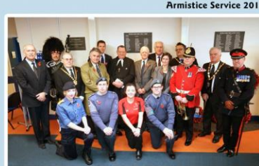
Armistice Service 2016