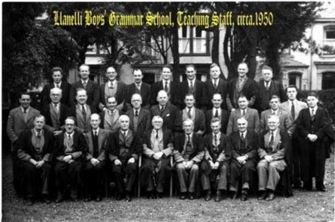
Llanelli Boys' Grammar School, Teaching Staff, circa.1950