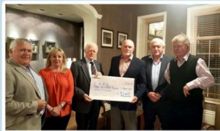
Music Award – Loud Applause Rising Stars

With your help - working to support young people in education, health, sport and music